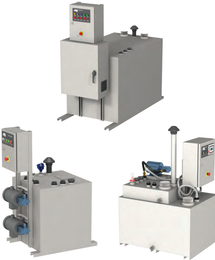
*Note: Tank type and configuration may vary.

The AXI Ready-Use Fuel Tank is a fuel storage tank constructed to customer specifications with various designs ranging from single wall or double wall construction, per UL-142 specifications, to fire safety tanks, per UL-2085 specifications. The tanks are available with pumps for transferring fuel to and from the storage tank. All tanks are designed with a interstitial wall to capture leaks and alert the user of an issue. All tanks are primed and finish coated to customer specification.